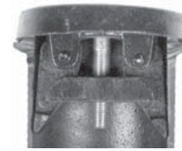
Installation of T-374, T-375

All 3 styles of CURB BOX REPAIR LIDS feature a brass screw, assembled after painting, to facilitate operation. To install, insert the two jaws into the shaft and tighten the screw with a standard pentagon key. The jaws expand to bear against the inside of the curb box. Designed to fit most makes of curb boxes, both old and new. Outside Repair Lids also work on most makes of inside style Curb Boxes; however, inside Repair Lids only work on inside style Curb Boxes.