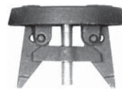
Outside (Old Style) T-374 (2-1/2") & T-375 (3")