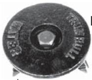
Inside (New Style)

...use Trumbull Curb Box Repair Lids to solve the problem of lost lids, broken lugs or broken tops on 2-1/2" and 3" Buffalo style curb boxes!