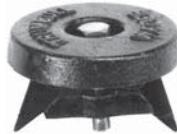
Outside (Old Style)