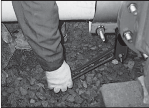
Adjustable head helps get to those hard-to-reach nuts and bolts!