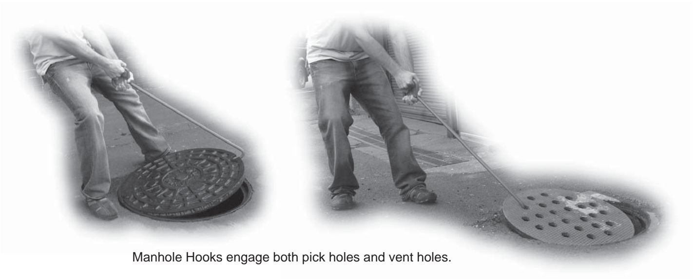
Manhole Hooks engage both pick holes and vent holes.