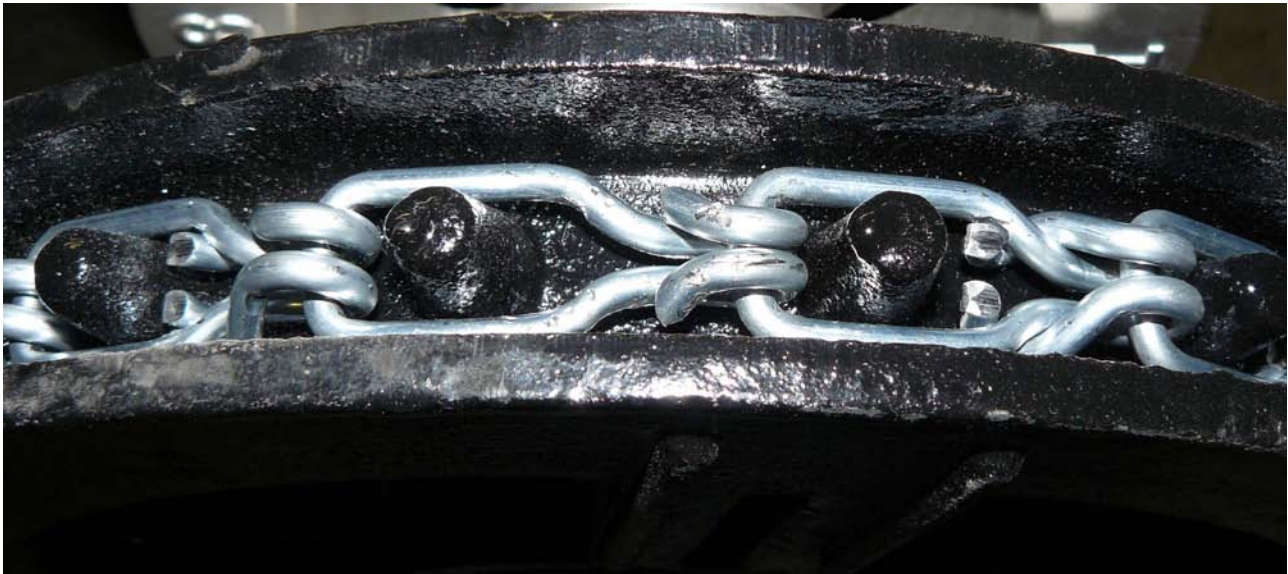
Shown with trimmed loop ends facing "down".

Joined Single Loop chain ends, shown in sprocket chainwheel.