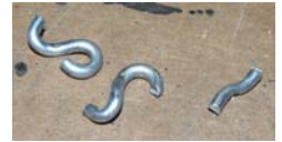
Partial segments, cut from chain end.