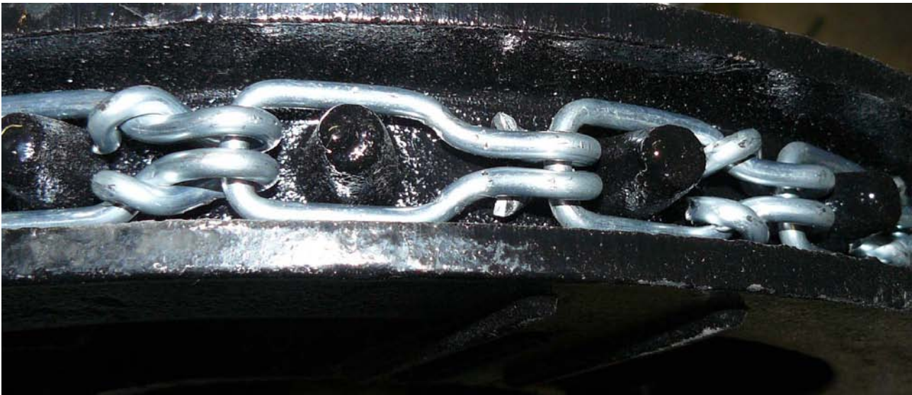
Shown with trimmed loop ends facing "up".