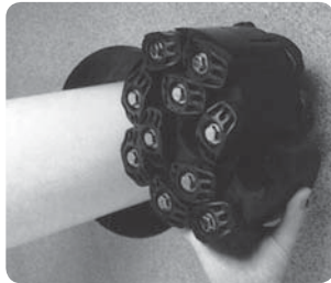
1. Link-Seal® modular seals are shipped as a belt of interconnecting rubber links.