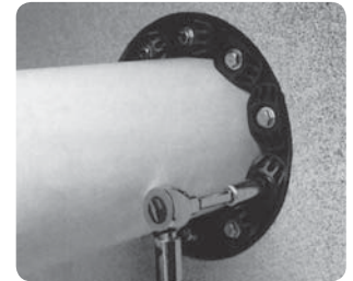
4. When the bolts are tightened, Link-Seal modular seals expand to create a gas and water tight seal.