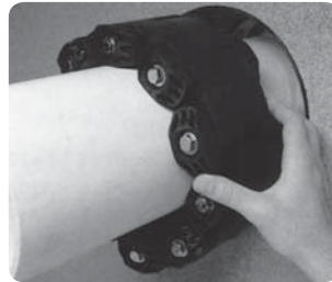
2. Wrap the belt around the pipe and connect the first and last links together.