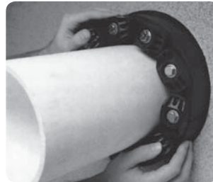
3. Slide the assembly into the space between the pipe and wall opening.