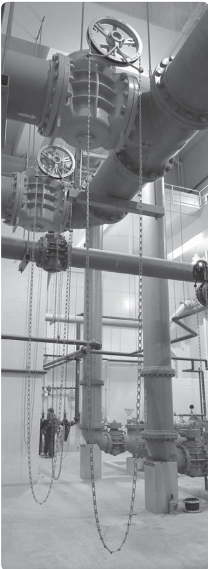
Chain in pathway.

The "Chain-Up" device stores chain overhead and safely above the pathway. Simply hook the clevis pin into a chain link at the desired overhead height and insert the chain into the device. Pull on the handle to release the chain for operation. After use, the chain is placed back into the Chain-Up, and hooked at the desired height. Furnished in Safety Orange. Made of high-strength thermoplastic polymer.