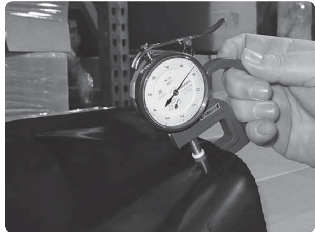
Trumbull's Polywrap is manufactured and inspected for compliance with AWWA C105 8 mil minimum thickness.