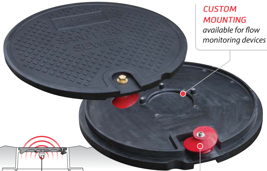
CUSTOM MOUNTING available for flow monitoring devices