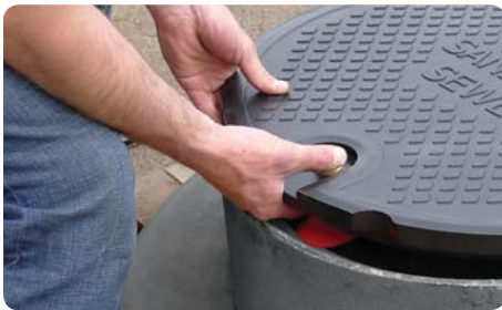
LIGHT WEIGHT Reduces finger and back injuries