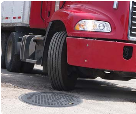
RATED FOR TRAFFIC LOADS Tested in excess of 40,000 lbs.