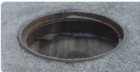
NO SCRAP VALUE Reduces theft problem common to CI lids

TRUMBULL POLYMER MANHOLE LIDS are today's smart choice for highway use in place of cast iron lids. They have been successfully tested to a 40,000 lb. proof load per AASHTO M-306, H-20. Test report from independent lab is available upon request.