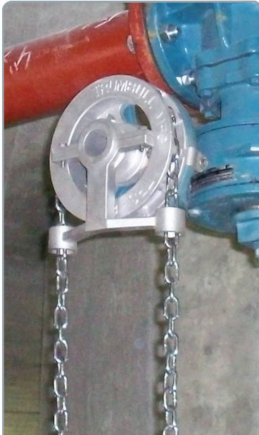
Used to operate overhead valves from the floor.

POCKET-TYPE using welded link machine chain