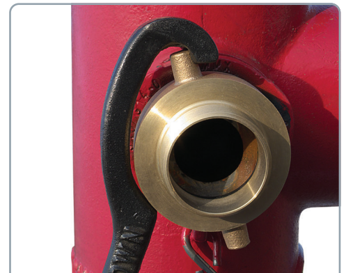
Hydrant Operating Wrenches are shown on page A-4.