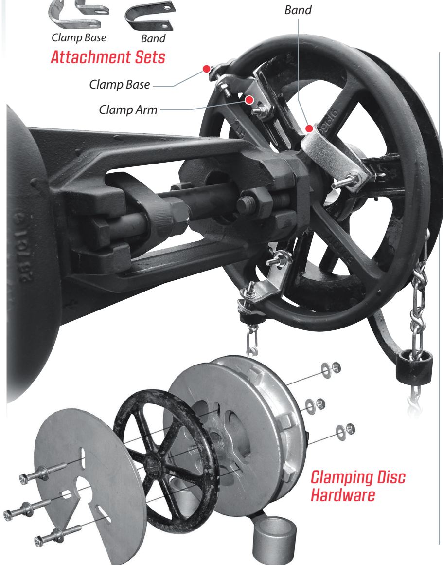
Clamping Disc Hardware