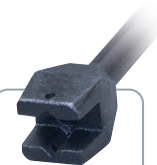
#1302 casting fits directly on t-head of curb stops