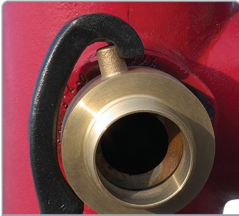
Internal core works on pin-type Hose Couplings or Hydrant Adapters.