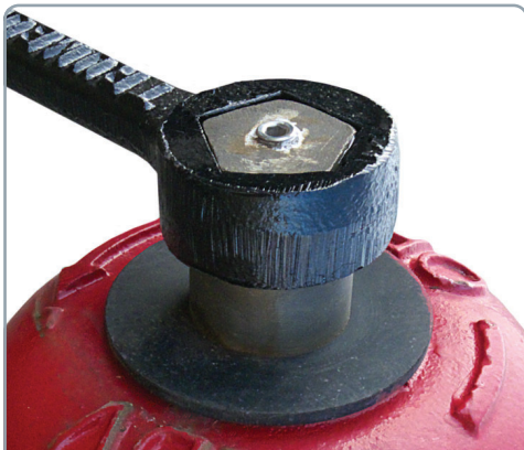
Grips and retains pentagon or square operating nuts.