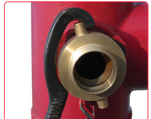
HYDRANT OPERATING WRENCHES ARE SHOWN ON PAGE A-4.