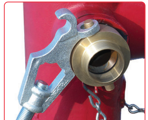
ADJUSTABLE HYDRANT WRENCHES ARE SHOWN ON PAGE A-5.