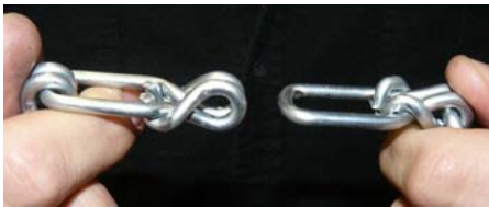
Chain ends, cleaned of partial, loose, pieces.