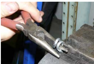
3.) Pry open the two trimmed loops, to insert the new chain link.