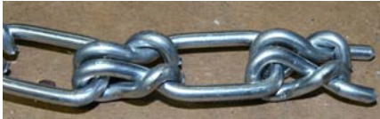
Chain end, as cut.

1.) Snip off the loose pieces from the ends of the chain segments to be joined.