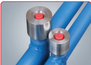
SIMPLE BUTTON-OPERATED LIGHT SWITCH.

Trumbull Lighted Keys make it easier for the operator to see the 2" nut on a main valve or t-head of a curb stop. Both models feature handles and shafts fabricated from Sch 40 steel pipe and extra strength tool castings.