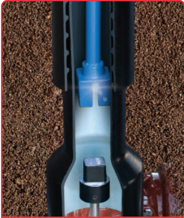
ILLUMINATES THE INSIDE OF CURB OR VALVE BOX.