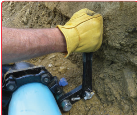
ADJUSTABLE HANDLE HELPS GET TO THOSE HARD-TO-REACH NUTS AND BOLTS!