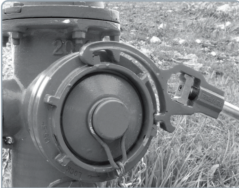
Works on 4" and 5" Storz caps.