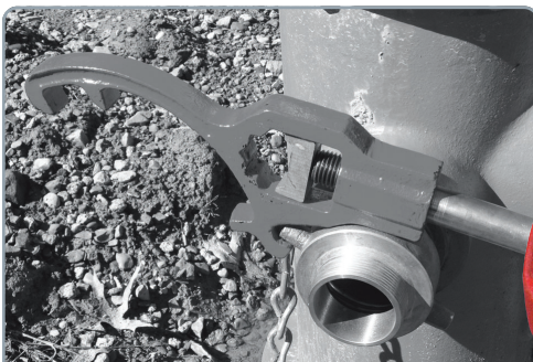
Works on hydrant adapters and hose couplings, both pin and lug type.