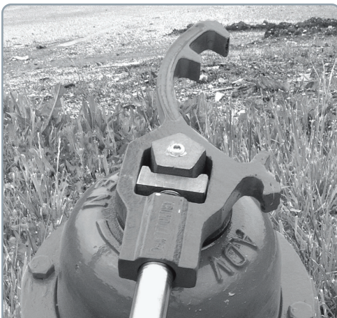
Wide bearing surface on wedge nut grips and retains operating nuts better than conventional threaded handles.