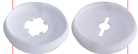
MODEL NO. 1